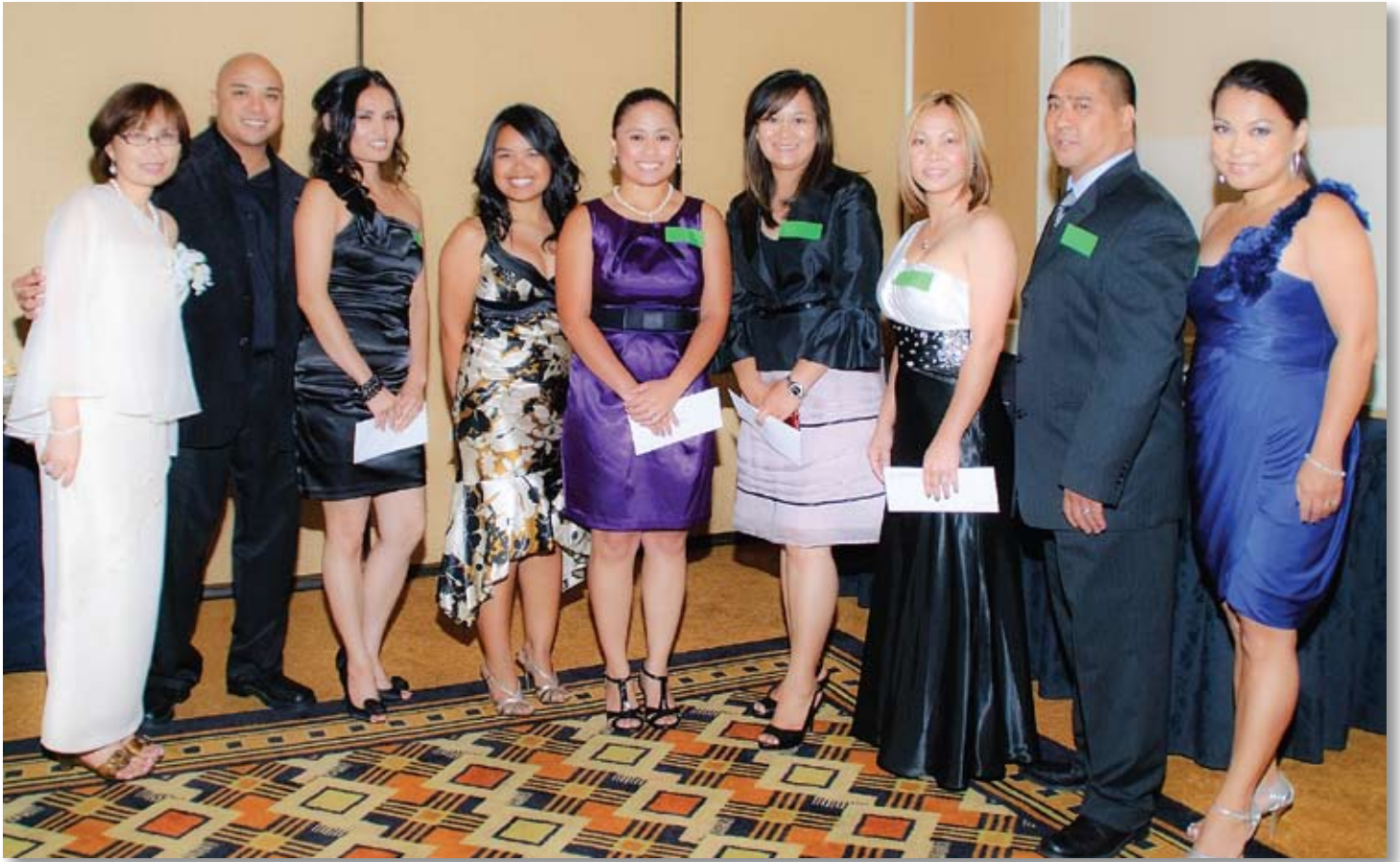
Scholarship Awardees 2010