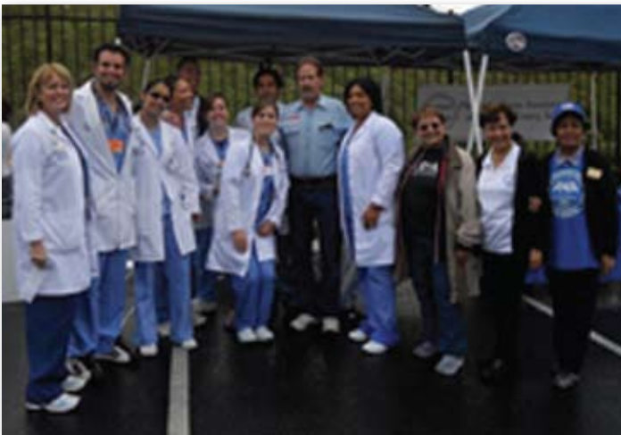
Paradise Valley Hospital Health and Wellness Fair Oct. 30 2010.