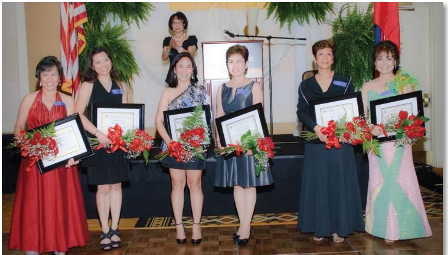
Nurse Excellence Award Recipients 2010