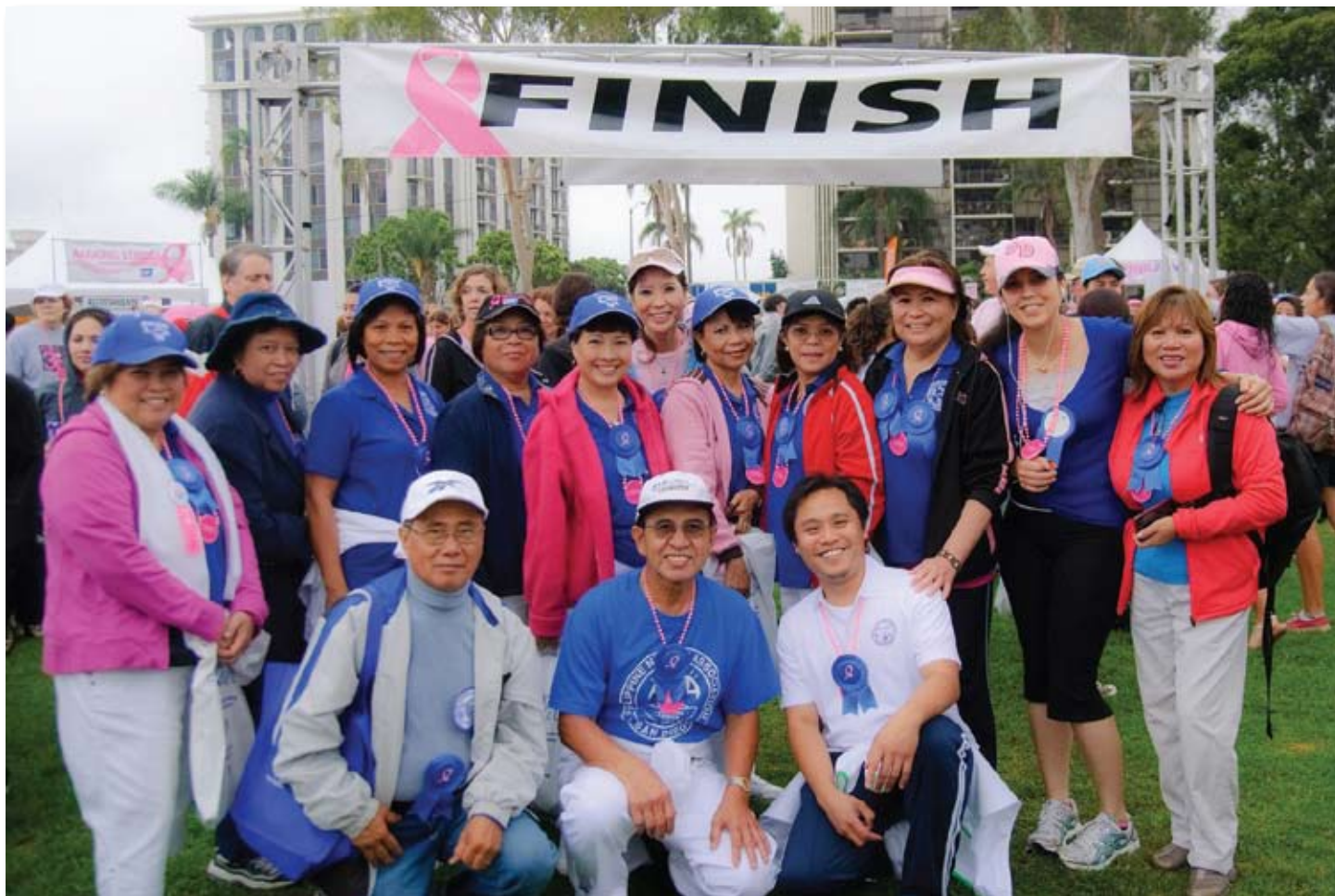
PNASD members at the finish line.

It is not how much you do but how much love you put in the doing. – Mother Theresa