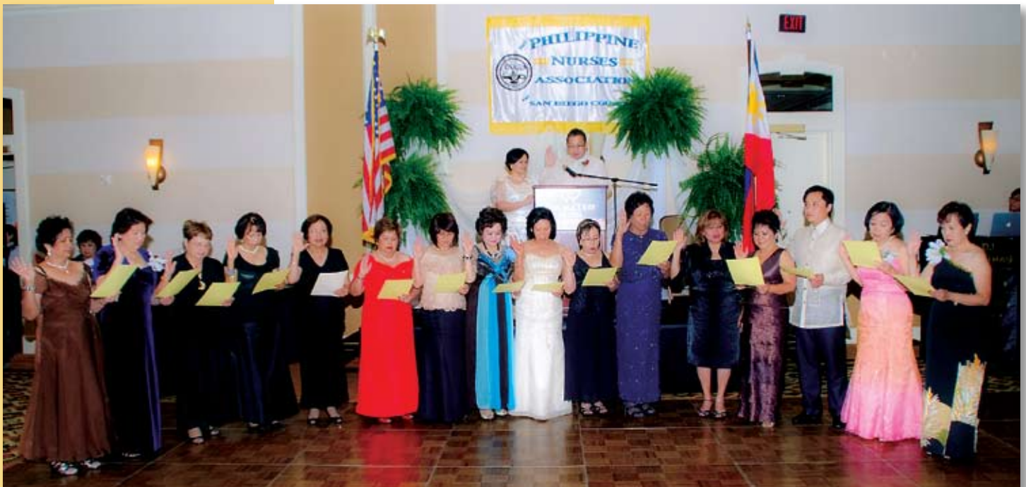
PNASD 2010 – 2012 Elected Officers taking their oath.