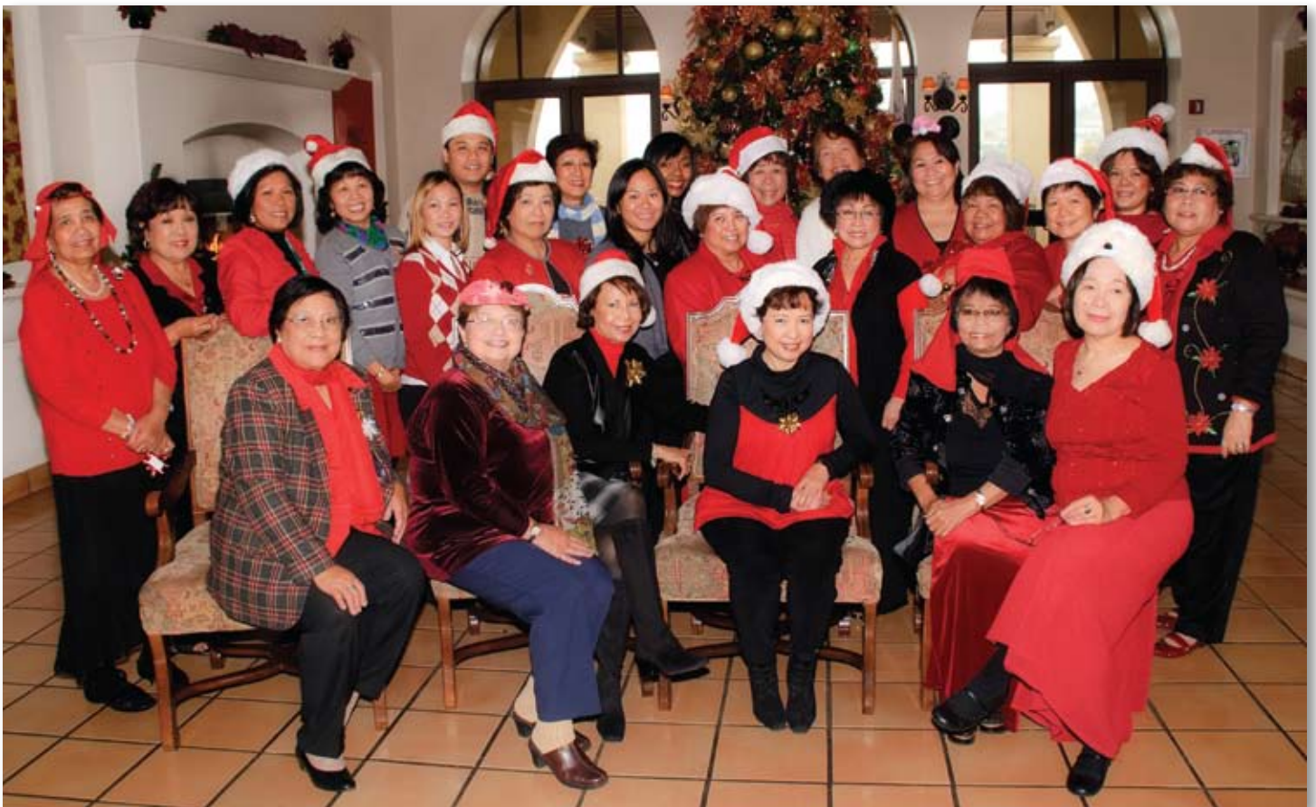
PNASD Celebrating Christmas Party on a Rainy Day

H ow fun to mingle with lots of jingle bells on December 19, 2010!. It was raining at the Admiral Bakers Field Clubhouse, but we still had a lot of fun at our Christmas party. There were some games, exchange of gifts, caroling, picture taking sessions, raffle drawing, dancing, singing, and great foods. It was obvious that everyone's having a good time and their faces were marked with a smile. It was a blessed day and that everyone greeted each other "Maligayang Pasko!". It was a lovely day and could not wait for the 2011 Christmas party...hopefully it will be a sunny day!