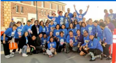
PNAA Foundation Fun Run 2011