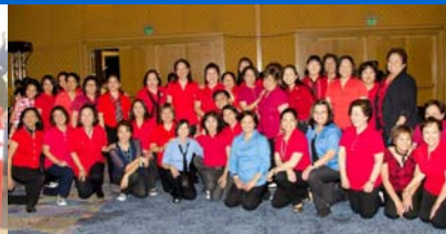
Welcome/Networking Night 2011